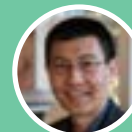
Kentaro Toyama 2017